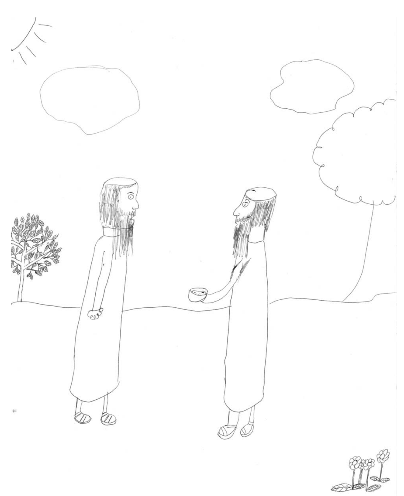
Esau & Ya'aqov